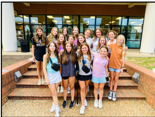
Gold Team at Gelati Celesti

The Panthers 2023 Fall Season started off with a bang on August 14th when the Gold Team began their season with a team building activity at Gelati Celesti! With the season well under way, Gold currently has a record of 7-0-2!